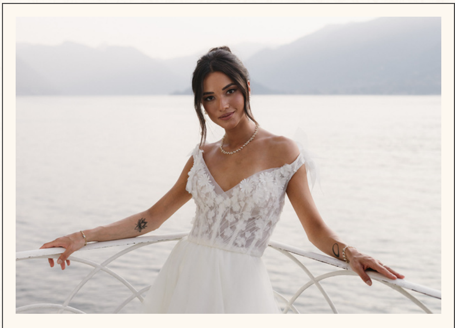
Package No. 1