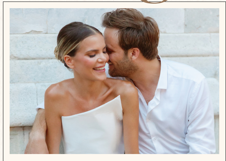
Package No. 2