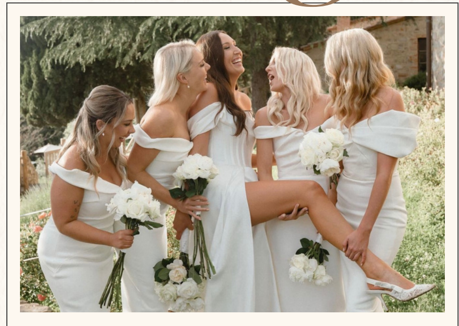
Package No. 4